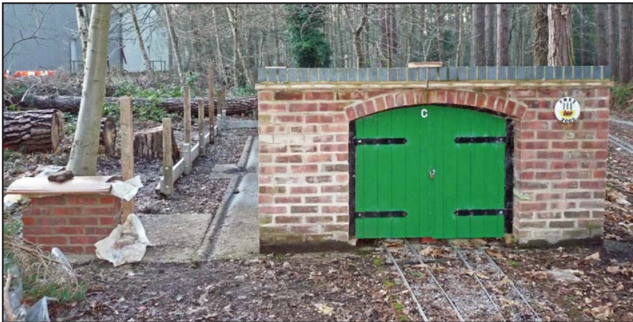
Ongoing works for Carriage Shed 'C'

Finally, now that the trees have been felled, the extension to Carriage Shed 'C' is forging ahead although the weather is not helping. The track for the shed has been built and is ready for installing.