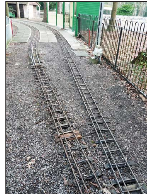
Newly laid track leading from the Station

Finally I would like to thank the ladies for their continuing support which once again proved invaluable in providing refreshments and selling tickets on running days, considerably enhancing our reputation with the public.