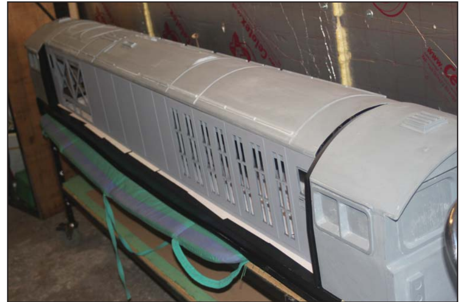
Class 58 primed for painting

I was going to only build a class 58 but due to some difficulties with the supplier of motors and other things the original planned date for start was delayed. I had been pulling freight over recent months, so three of us decided to build a batch of 20 Tippler wagons, BR built about 10000. We started in March 2012 and my part of the deal was to get the castings and laser cut frames ordered and do most of the machining I underestimated the amount that I agreed to do. To date I have now built 3 wagons up to the almost completed state apart from the dummy brake gear and the painting. All the machining is complete except for 36 buffers to be turned.