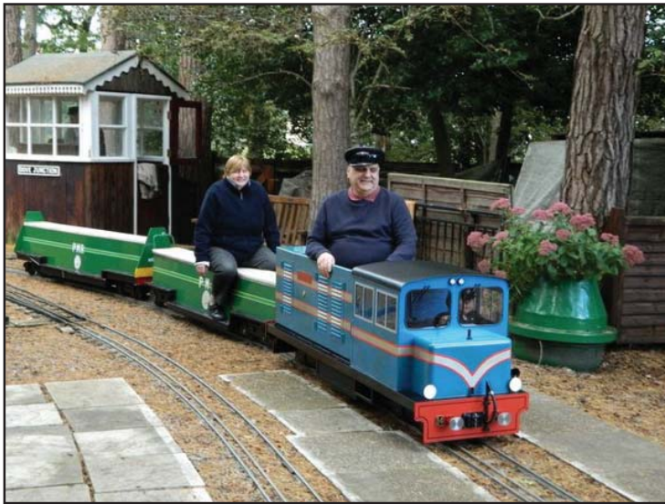
Ride On Railways 'Captain Howey' at Pinewood 2012

You may remember the very successful Ride on Railways Owners Rally that we held at Pinewood in September 2012. A number of letters of thanks were received from the visitors, thanking the society and its members for their hospitality, and asking if a repeat event could be held in 2013.