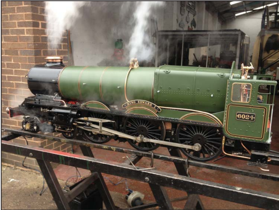
Paul Konig's 'King' undergoing its first firing, it should be seen at Pinewood later this year

The coming year will be an interesting one for PMRS, with our 'public face' very much at the forefront of our activities. Not just for our usual 'running days', but also for the 'Ride On Railways/ Station Road Steam' owners day in May, and the 'Pinewood Festival' in July.