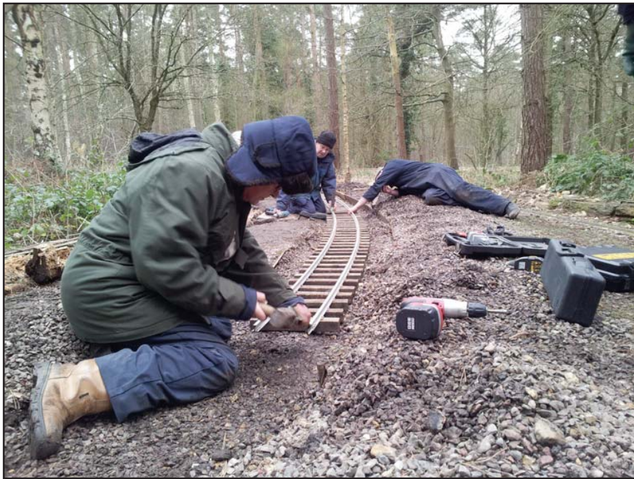
Just a usual Sunday morning's work for our Chairman