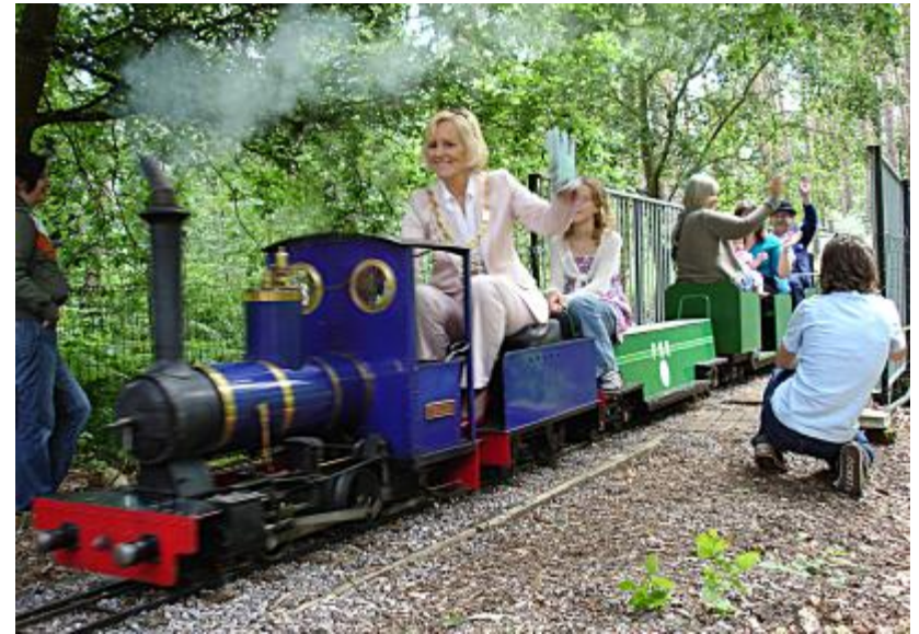
The Mayor makes a nifty getaway after cutting the ribbon on the bridge.

Members, in their turn, admired the confident handling of the locomotive and her willingness to risk a bit of oil and coal dust.